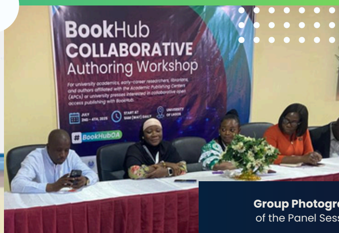
Group Photograph of the Panel Session